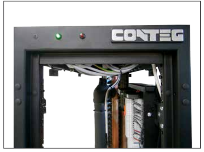
Color LEDs (green and red) for signalization of operation, and failure situation are very helpful for the DC supervisor's quick orientation.