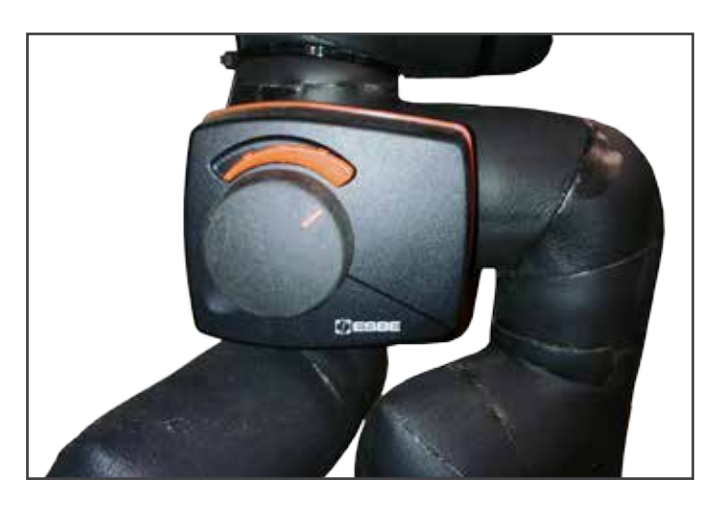
New type of thermal piping insulation.