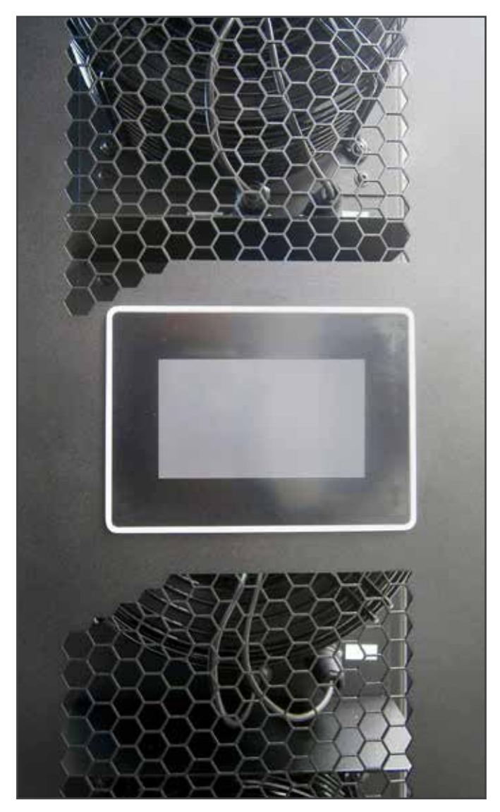
New design of CoolTeg Plus unit front door with hexagonal perforation with integrated color touch screen display.