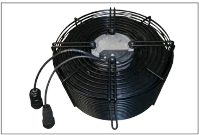
New fan grill for easier maintenance and two connectors for failsafe installation.

Although this catalog was prepared, produced and checked with the best care, Conteg, spol. s r.o. cannot accept any liability for omissions or errors in this publication. Due to the continuous development and progress, Conteg, spol. s r.o. also reserves the right to change details and technical specifications of the products shown in this catalogue. Such changes along with eventual errors or printing errata shall not constitute grounds for compensation.