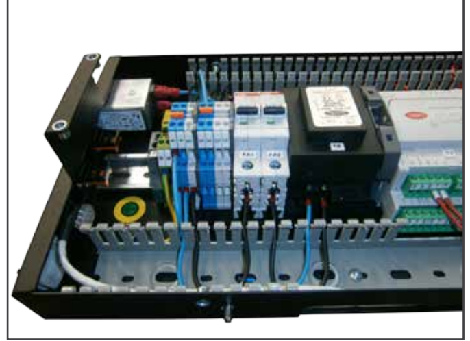
Marking of cables and terminals for user friendly maintenance and better internal orientation.