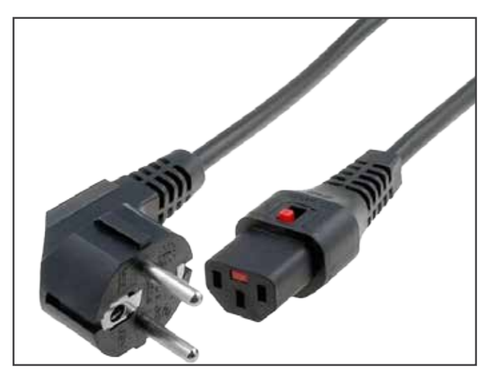
Schuko/C13 cable with pull-out lock as a standard accessory.