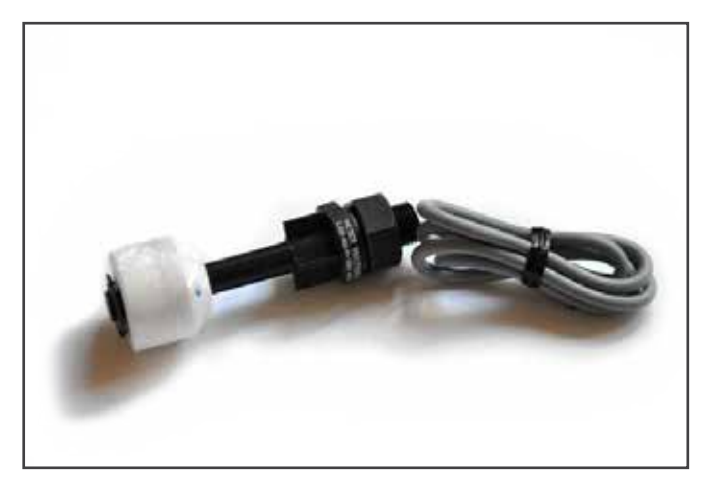
Water level sensor in the drain pan is standard (for warning when condensate level threaten with overflow)