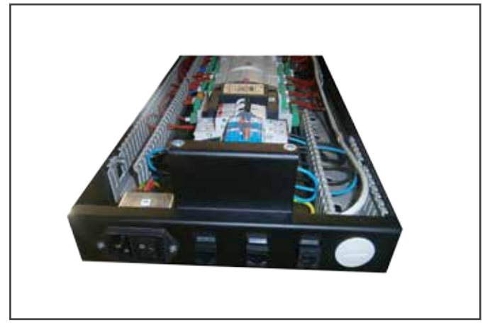
New position of connectors from the bottom of the electro box. Power supply (C14) one-phase with switch, network connectors (RJ45) COM1 and COM2, and service port (RJ12) for service display connection) .