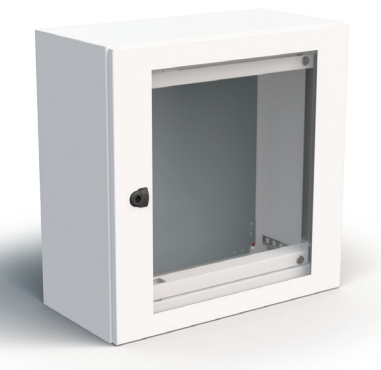
Enclosure with glazed door