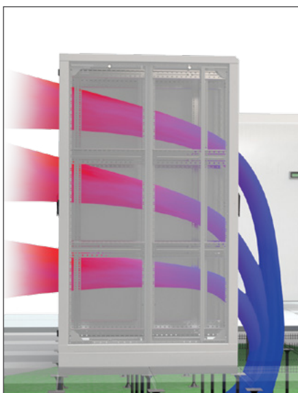
Cold air is delivered to the cold aisle using a raised floor as a cold air handling plenum. The hot air is blown out on the back side to the hot aisle.

Hot/Cold Aisle design can be modified in various ways to meet today's higher energy efficiency requirements. It can be easily improved (i.e. by separating the cold and the hot air streams) making the solution contained. See next chapter to learn more.