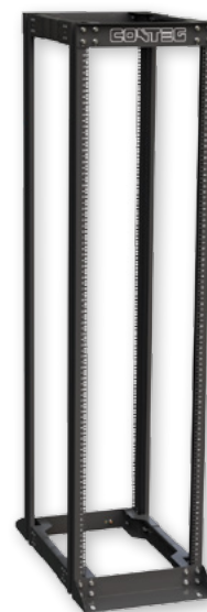
The RSG open frame series (two and four posts) is a rack alternative which gives you unmatched access to installed equipment.