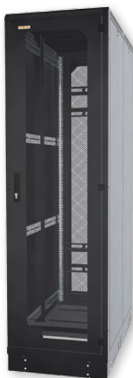
Rack design in a hot-cold aisle arrangement requires front vented (83%) & rear vented (83%) doors to easily enter the rack.