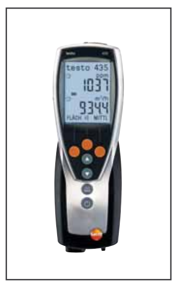
Multifunctional measurement device for connection of special