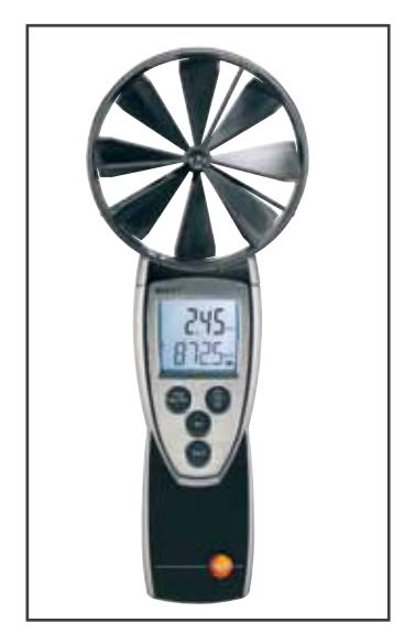
Propeller-type flow meter, diameter 100mm

Variables of the laboratory environment are monitored on a long-term basis with the aid of installed sensors from which signals go to the measurement central point. There, they are processed with a specially designed laboratory software which makes possible evaluation of data for individual experiments, as well as visualization and presentation of the outcome. Another – independent – measurement system consists of wireless temperature and humidity sensors which may be used both in the laboratory and in another (real) data center for practical verification of the laboratory measurements. A third option is to make use of separate calibrated tools for accurate measurements of all local variables.