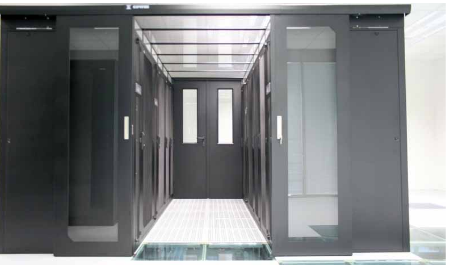
View of a contained aisle in the laboratory

TestCenter's total area of 156 m² is divided into a technical room and a climatic laboratory. In the laboratory's frontroom, hardware and software for the center's management are installed. The laboratory itself is separated by a glass wall and is designed as a data center, with a raised floor and suspended ceiling. The data center's area is 75 m²; it is possible, similar to real applications, to install there stand-alone cabinets as well as cabinet rows, contained aisles and closed loops.