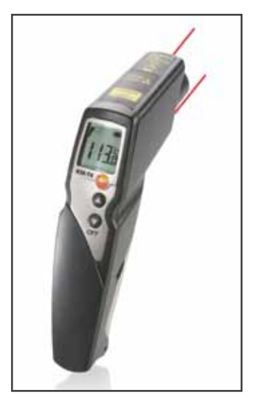
Proximity infrared thermometer