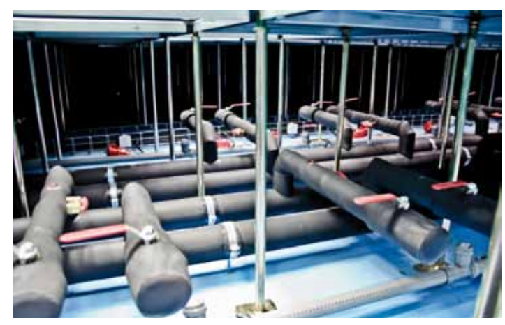
Cooling distribution system under the raised floor

Two water-cooled chillers are the source of chilled water; one of the chillers is equipped with a free-cooling system. Dry coolers are situated on the roof of the multifunctional building and the cooling machinery room is installed in the basement. A sophisticated regulation system enables both systems to independently supply the laboratory with chilled water at the required levels of flow rate and temperature values. All energy flows can be accurately measured.