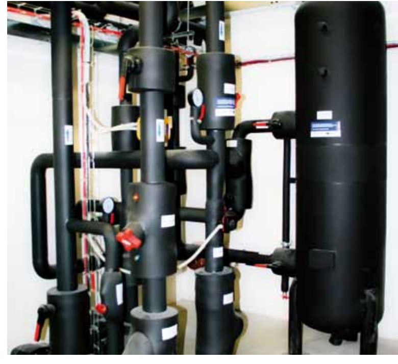
Laboratory machinery room

The TestCenter will not only be used for validation of energy efficiency and quality of comprehensive solutions of data centers designed, and set up from components made by Conteg but also for verification of correct selection, efficiency, economy, functionality and safety of technologies already implemented, as requested by our customers.