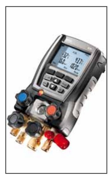
Digital measurement gauge for cooling devices