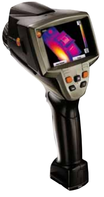
Thermo-camera and visual preview

Two state-of-the-art thermo-cameras are used for a simple graphical visualization of the temperature mappings, especially on surfaces of cabinets and structures.